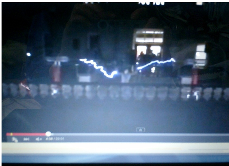
There Can Be Only One

The 2017 Engineering Open House is scheduled for Friday, March 10, 2017 and Saturday, March 11, 2017. The Tesla Coil Concert is Friday, March 10, around 7 PM, for a good seat.